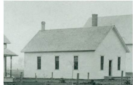
The first church building

As a result of this meeting property was purchased and a frame building was built at a total cost of $500. Hence our first church was named Zion German Evangelical Lutheran Church and dedicated September 1, 1895 with a German service in the morning and an English service in the afternoon. This building was also used as a school with classes beginning that same fall under the tutorage of J. C. Winterstein. It was also decided at one of the early meetings that we would share the Richland Lutheran Cemetery with St. Peter Lutheran Church.