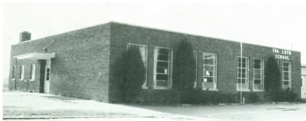
Zion Lutheran School

Iva Zion celebrated its 50th anniversary in 1945. At that time there were 525 souls; nearly 400 communicant members, 110 voting members and 35 school children. A public address system was bought that year and the Men's Club was formed.