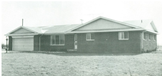
Parsonage and teacherage built in 1966.