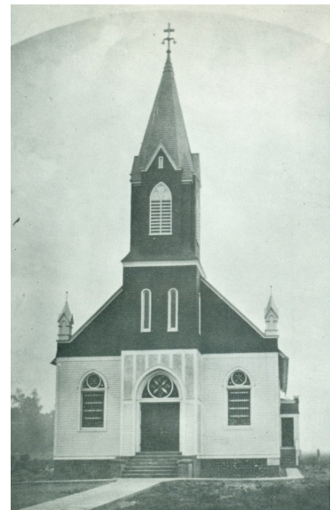
Church built in 1907-08.