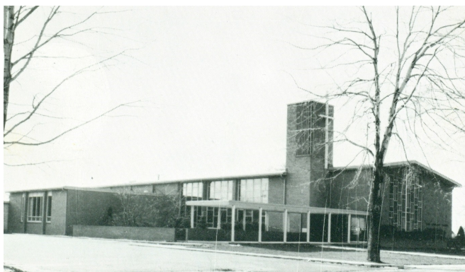
Church built in 1958.